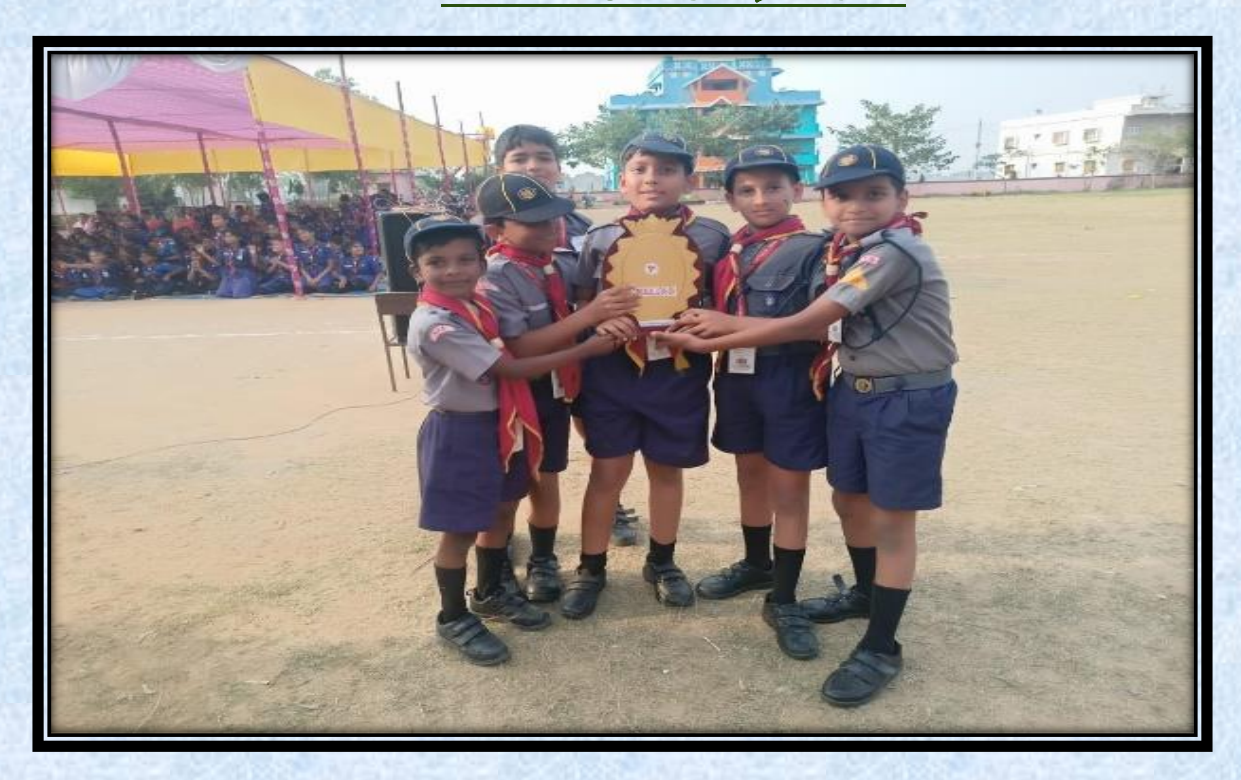
GREETINGS (CUBS)—— 1<sup>st</sup>