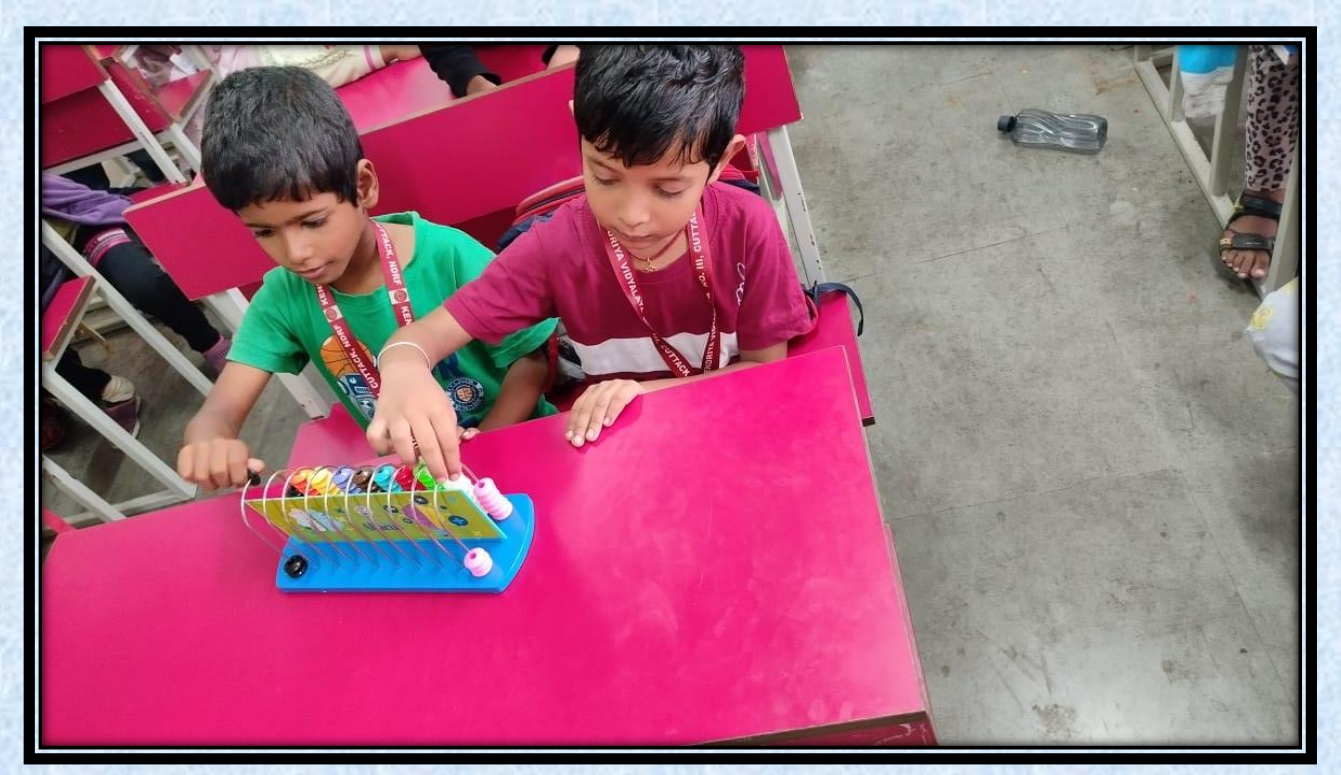
LEARNING BY DOING