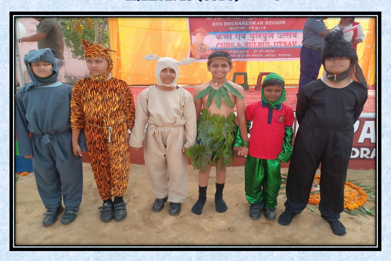
SKIT - 1<sup>st</sup>